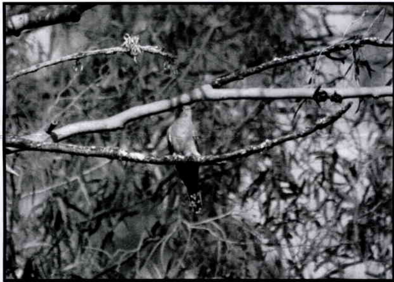
Fan-tailed Cuckoo

Proceeding to Redbank Creek, we walked along part of the creek near the horse paddock; then across the creek crossing and along the track. We were fortunate to see a Fan-tailed Cuckoo (a first for the author). Unfortunately, several Rainbow Bee-eaters seen only the week before were not evident. Species at this location included:- Jacky Winter , Magpie , Grey Fantail , Peaceful Dove , Bar-shouldered Dove , Yellow-rumped Thornbill , Yellow Thornbill , White-browed Scrubwren , Red-browed Finch , Golden Whistler (male and female), Eastern Yellow Robin , Variegated Fairy-wren , Red-backed Fairy-wren , Lewin's Honeyeater , Brown Honeyeater , Striated Pardalote , Willie Wagtail , White-throated Gerygone , Silvereye , King Parrot and Pied Currawong .