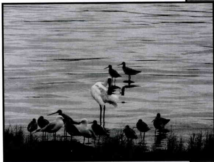
'Loafers in Cairns'