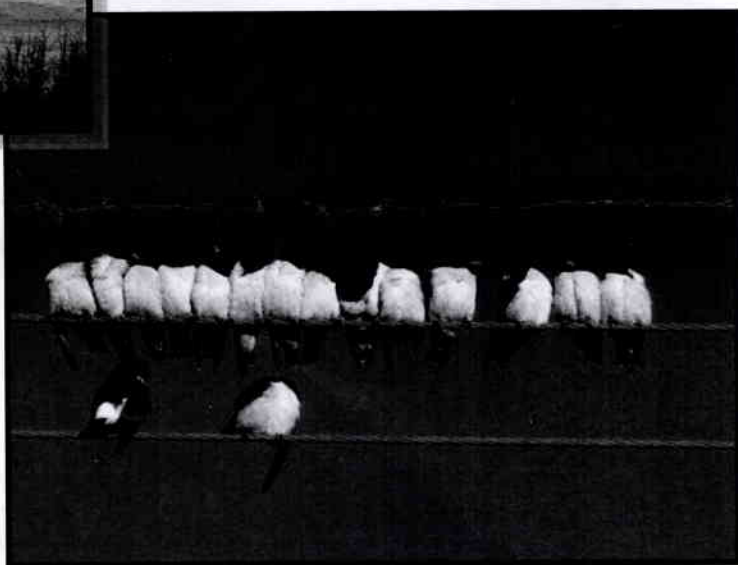
'Togetherness' White-breasted Woodswallows