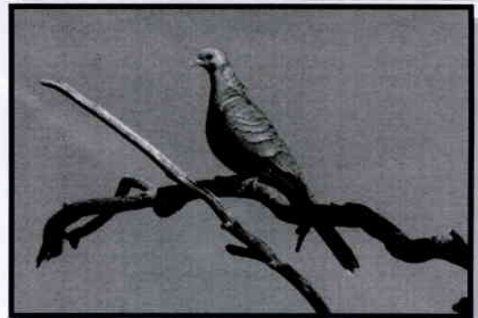
Rufous songlark (photo 1 and 2) Eastern yellow Robin Bar shouldered dove