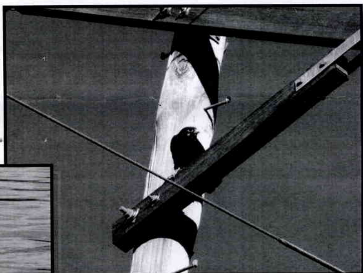
'Shapes and Textures' Brown Falcon

For all bird photographers... amateur, professional and anywhere in between, please send your favourite photos in to be published in our monthly newsletter.