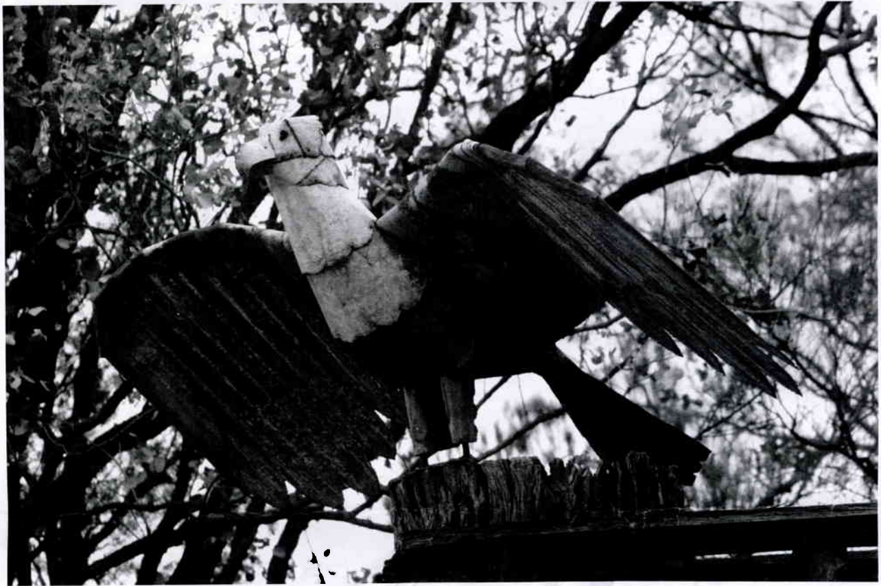
Eagle sculpture, Myall Park Botanic Gardens

A big thank you to all involved especially the leaders.