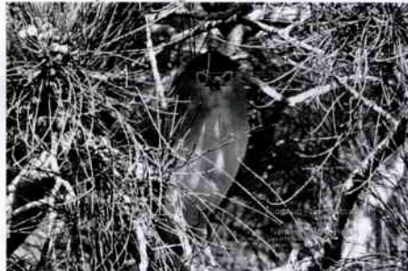
Nankeen night heron