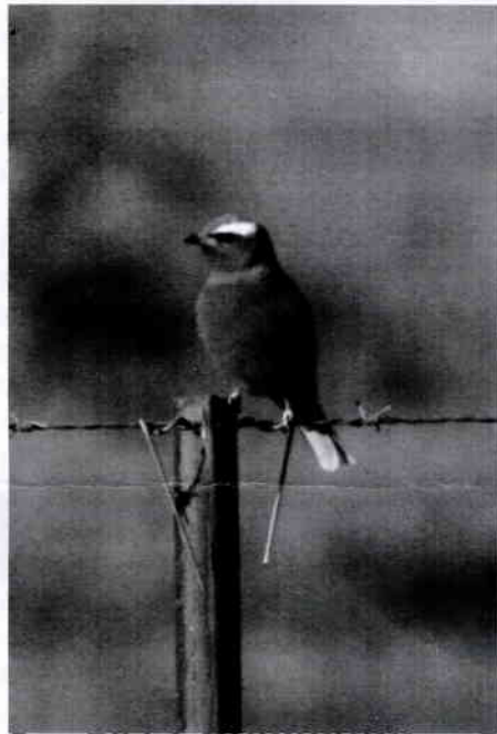
211 spp as at 13th August