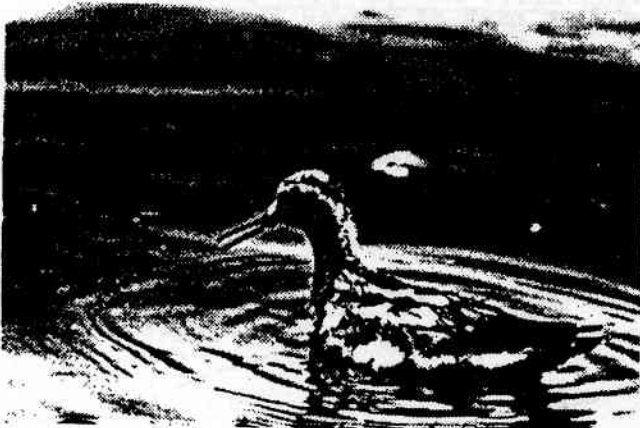
The Red-necked Phalarope

CALENDARS: We have a number of R.A.O.U. calendars available now, price $9.00. These contain many beautiful bird photographs, are good value and make ideal Christmas gifts for sending overseas. Contact Ann Shore, Shorelands, Withcott, M.S. 224 Toowoomba, Qld 4352 or please phone 076 303207.